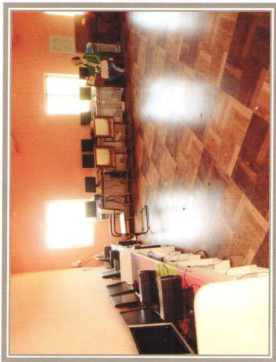
Computer Lab Inside View