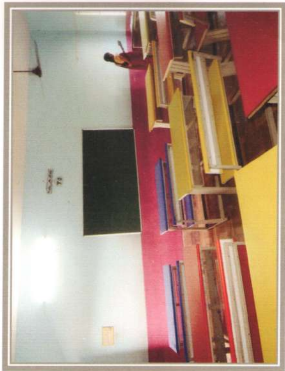
Class Room Inside View